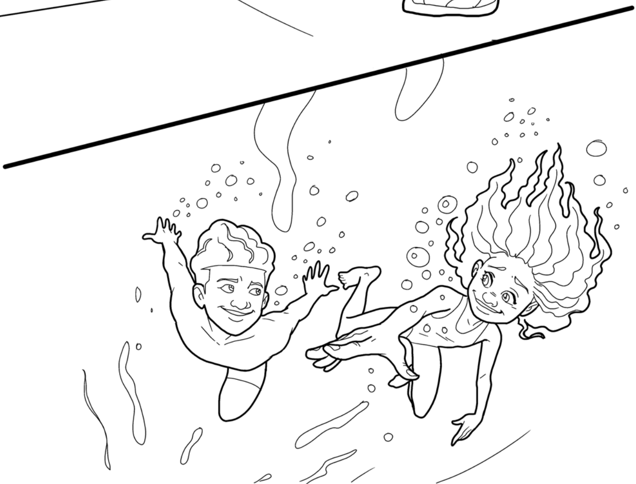
In the summer, we sell lemonade and go swimming all of the time.