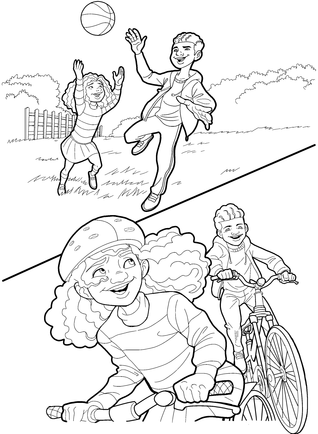
We are always playing basketball, tag, rollerblading and riding bikes.